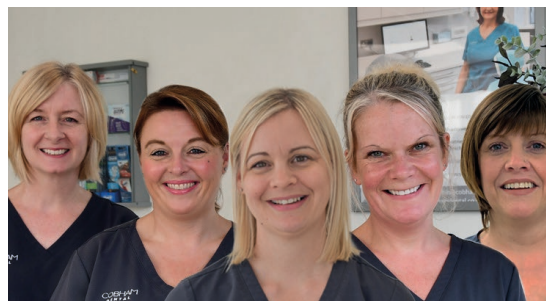
Cobham Dental Team