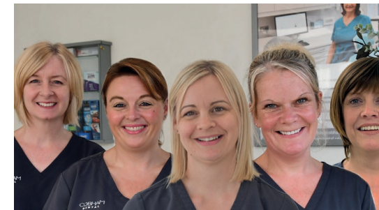
Cobham Dental Team