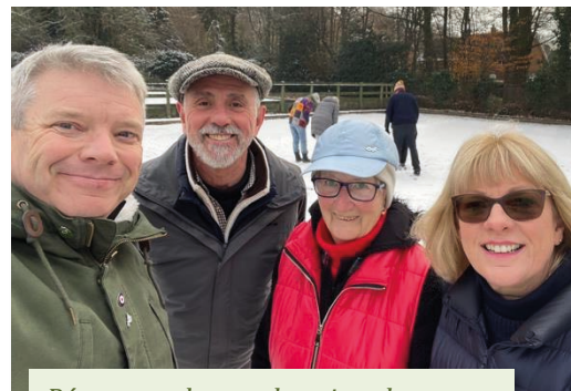
Pétanque players: braving the snow

different game with different skills when the glass walls are wet, dedicated OVSC tennis players can simply don waterproofs and look forward to a hot shower after games of tennis, and matches generally continue unless it's really pelting down.