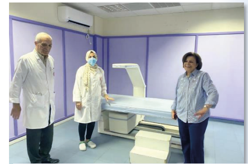
The DEXA bone scanning machine at Al Ahli Hospital, paid for by Embrace supporters

Last year, St Andrew's donated £2,000 to Embrace the Middle East; to find out more about their work, visit www.embraceme.org