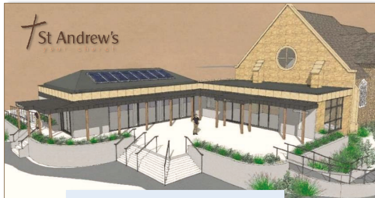
The proposed Southwest elevation

This drawing by the architect (right) only shows one aspect of our plans – fuller details, including other views and the internal plans, are on display in the church vestibule, so do feel free to take some time looking at all the various elements!