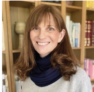
Su leads the Church Engagement Team at Embrace the Middle East

On a good day the population gets 4 hours of electricity. Those that can afford it have installed solar panels, those that can't go without. At night it's strange to stare at apartment blocks where so few of the windows are lit.