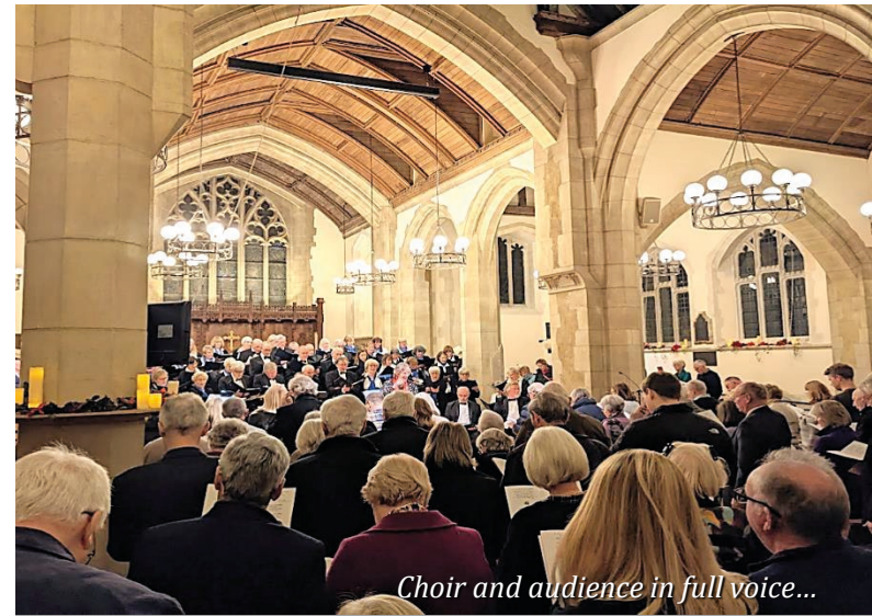
Choir and audience in full voice...