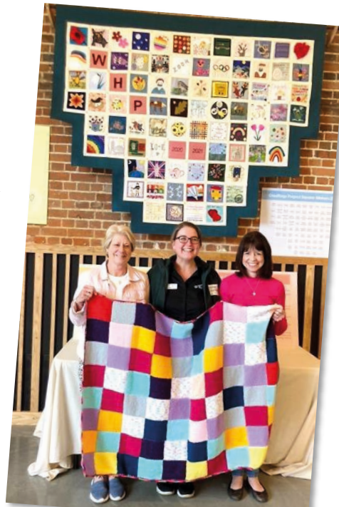
The GladRags quilt and knitted blanket