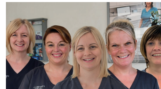
Cobham Dental Team