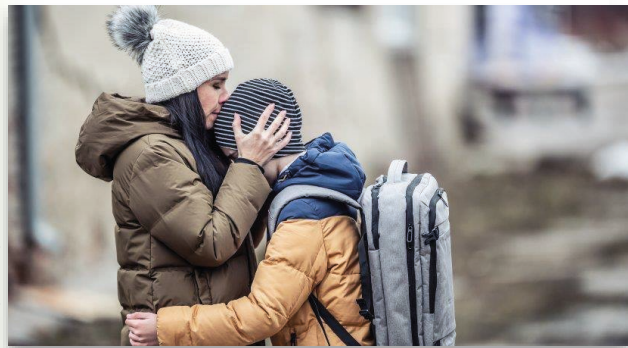
Surrey County Council

Surrey communities have been fantastic in rallying together to make our Ukrainian guests welcome and have enabled them to integrate into life