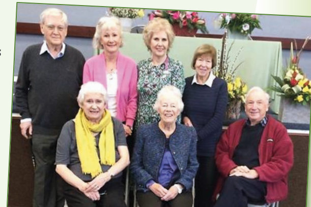
The OFAS Committee