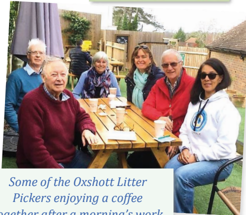
Some of the Oxshott Litter Pickers enjoying a coffee together after a morning's work