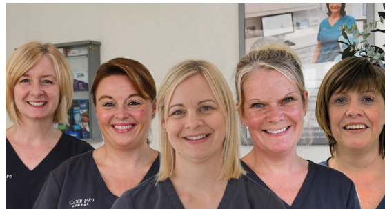
Cobham Dental Team