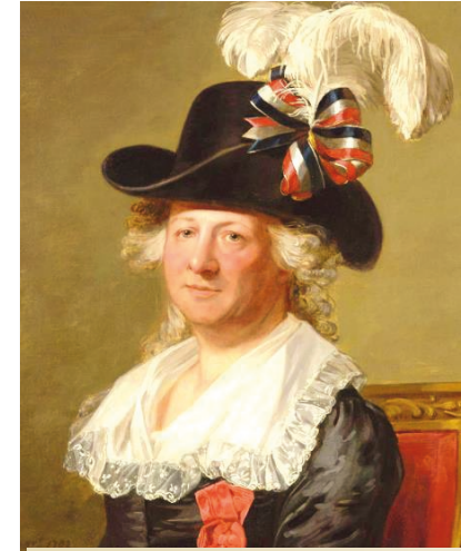
Le Chevalier d'Éon wearing the Order of St Louis, the highest military honour of the Kingdom of France.