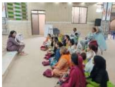
Teaching Session at Shahdara and Manga Mandi