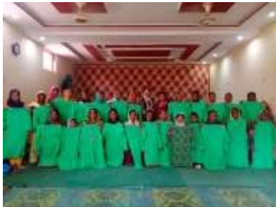
Sewing Test Sikander Pura