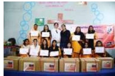
Sewing Graduation of Sikander Pura, Mudkay, and Baath