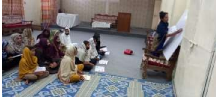
Sewing and Literacy Test HELP Sewing and Literacy Manga Mandi