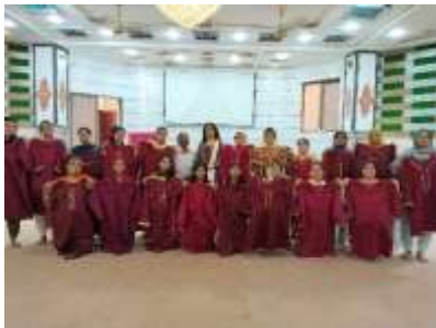
Sewing Test Shahdara