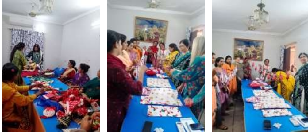
While showing products for the sale and learning from each other

This year we did not have any workshops because of several reasons, the main reason being that our sewing trainer was not available most of the time. But our sewing teachers together learnt from each other many times and shared what they learnt and also contributed their skills for making things for the Christmas sale.