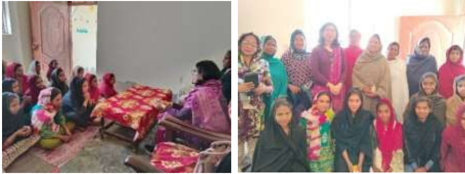
Visit to Gamber Sewing and Literacy Centre