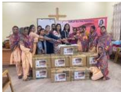
Group Photo and Cake Cutting at Sewing Graduation Fateh Pur