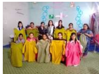
Sewing Test Baath