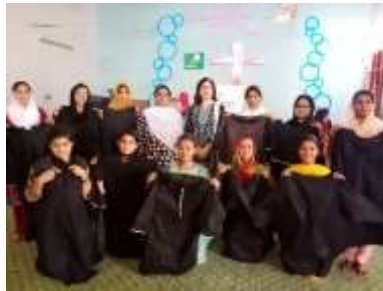
Sewing Test Mudkay