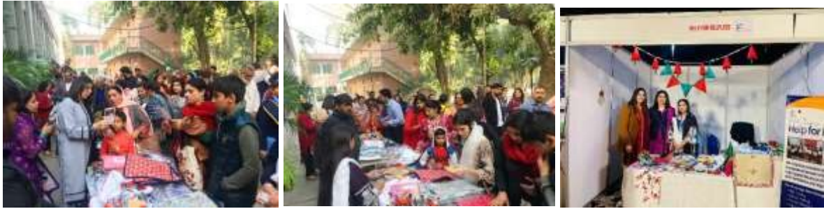
HELP Christmas Stall at FC College CHURCH and Stall at the TEF Expo