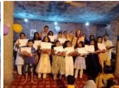
Literacy Graduation of Baath, Shahdara, and Paracha Colony